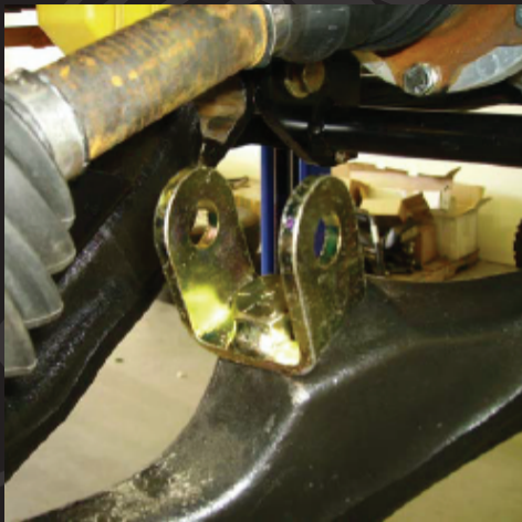
A. Clevis in lower control arm.