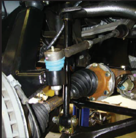
B. End Link in place, clevis rotated so bushing is relaxed.