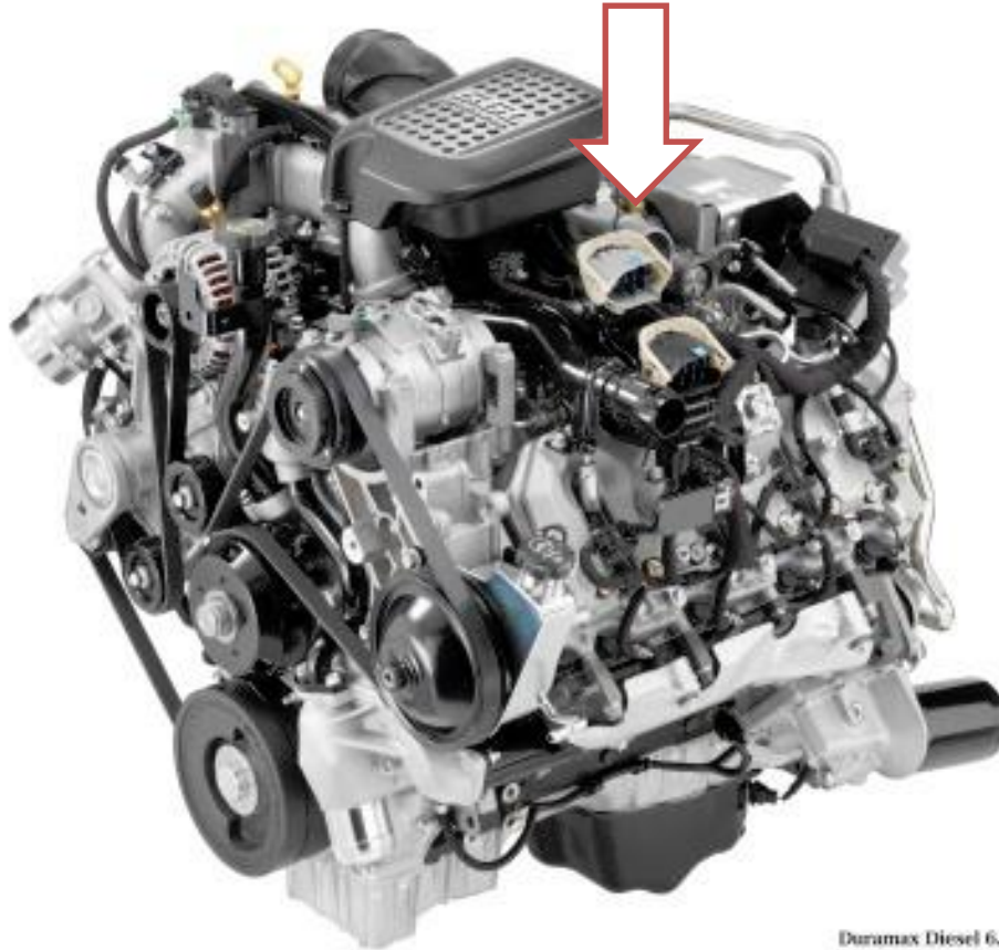
GMC Sierra HD