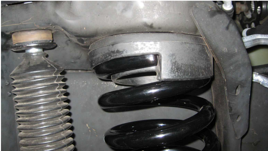
Figure 4. Passenger side (pictured with 5112 kit)