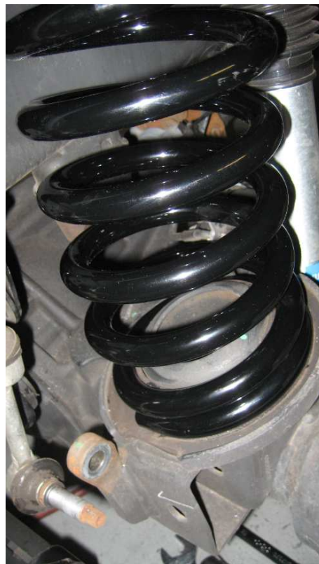
Figure 7. Driver side (pictured with 5112 kit)