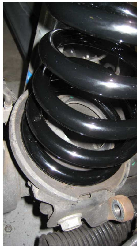
Figure 5. Passenger side (pictured with 5112 kit)