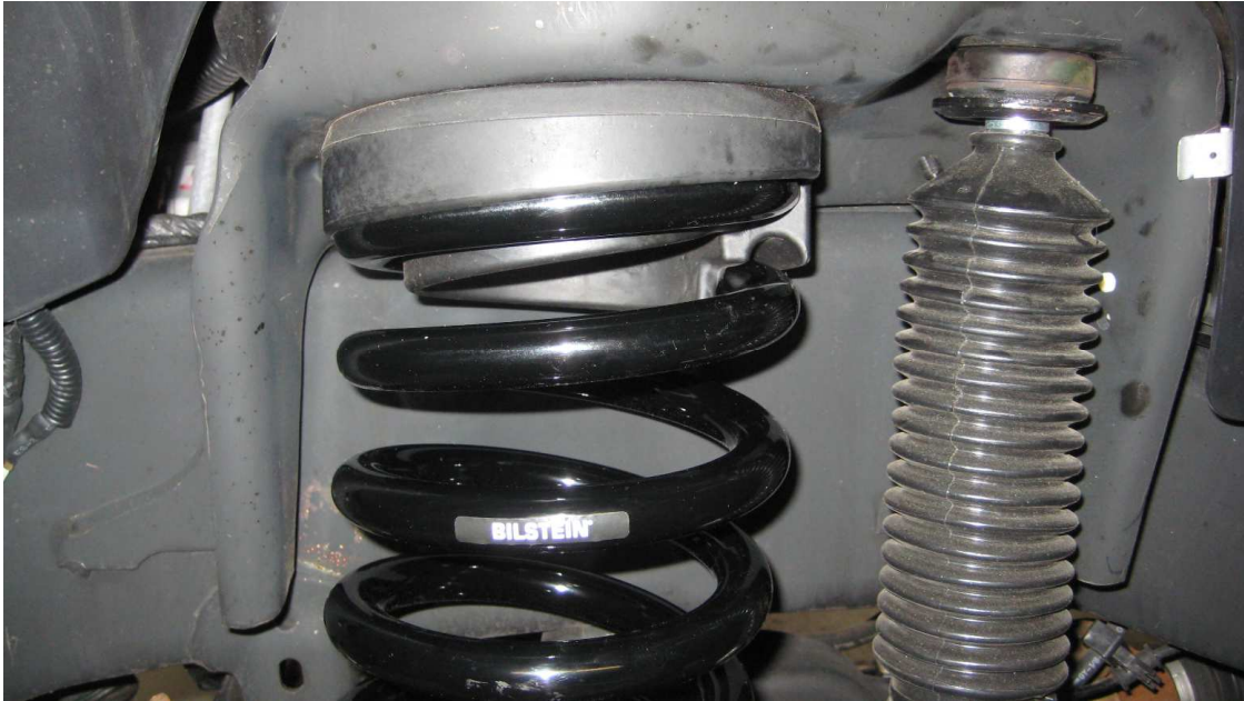
Figure 6. Driver side (pictured with 5112 kit)