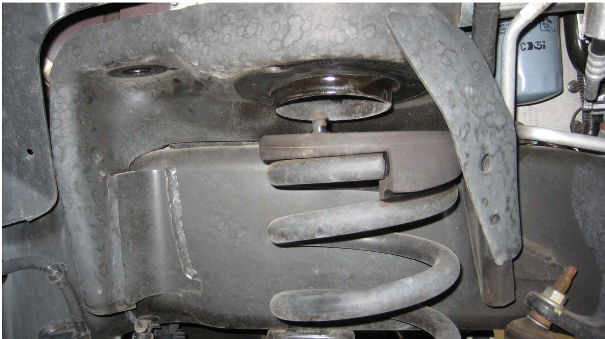
Figure 3. Passenger side