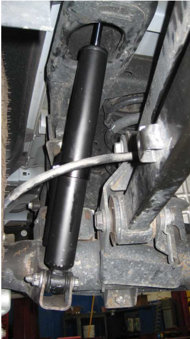
Figure 2 – Passenger side (looking towards the rear)