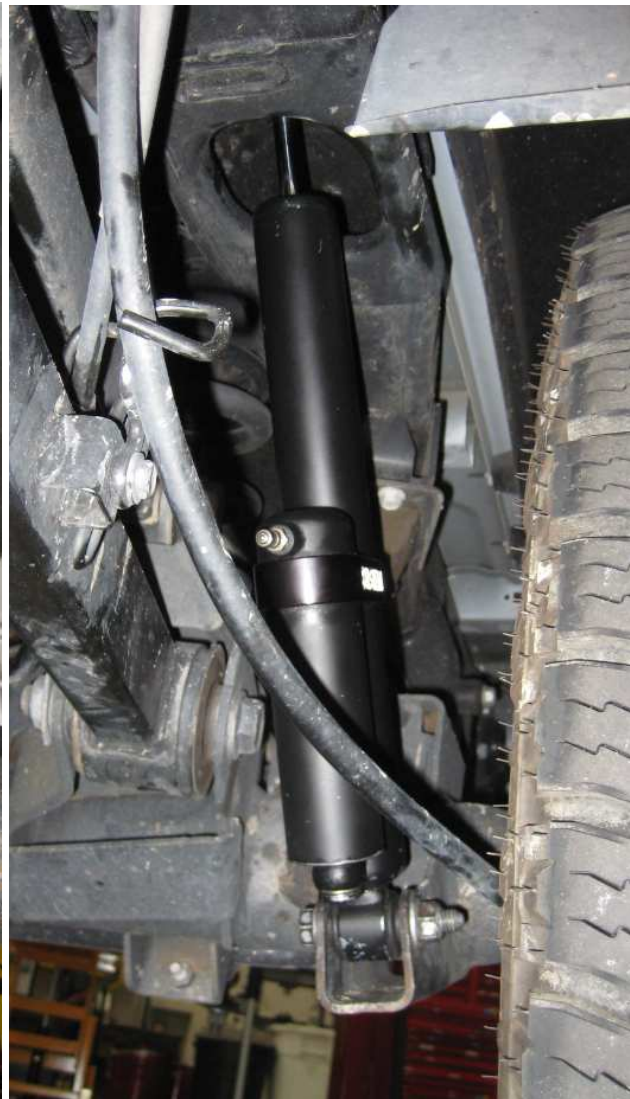
Figure 3 – Driver side (looking towards the rear)

Note: The shocks depicted herein differ slightly in appearance from the supplied components.