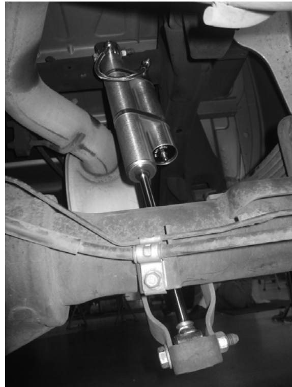
Figure 5. rear passenger side