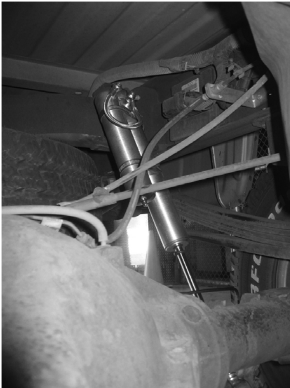
Figure 4. rear driver side